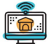
Brokerage website displays (including IDX and VOW)