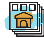
Flyers displayed in windows

Policy 8.0 states that a property must be listed in the MLS within one business day of marketing a property to the public. Public marketing includes, but is not limited to: