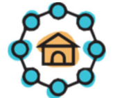
Multi-brokerage listing sharing networks (Facebook groups)