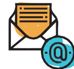
Digital Communications Marketing (email blasts)